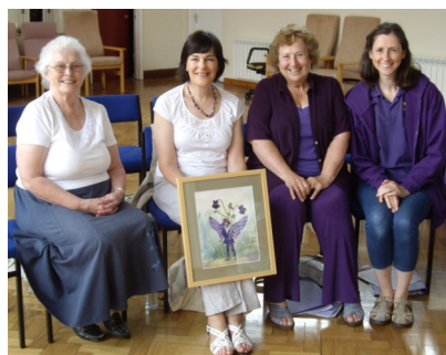
WOWSingers: The Annes! There are no relations at WOW but, for a small choir, it does seem to attract an extraordinary number of Annes!