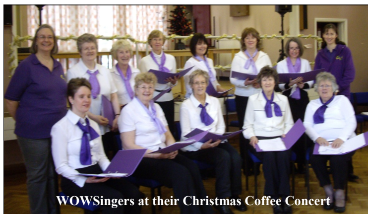
WOWSingers at their Christmas Coffee Concert

Singers in Wilmslow! Before Christmas, we had around 10-12 regular attendees but after the success of their Christmas coffee concert, that number has now increased to about 24. At the moment they are all ladies, and in due course we'll make the decision as to whether or not they become, like CounterPoynt , a permanent 'Ladies Choir'. They make a super sound, and have made such good progress that from February half term WOWSingers will be moving on to 90-minute sessions. Well done WOW ladies!