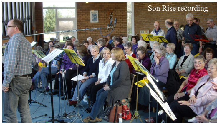
Son Rise recording

Sat 15th Dec: TBC 1-3pm Tatton Home Farm